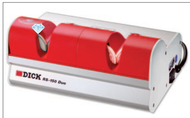
Sharpening and Honing Machine – for highest demands DICK RS-150 DUO

We will happily send you detailed information about our range.