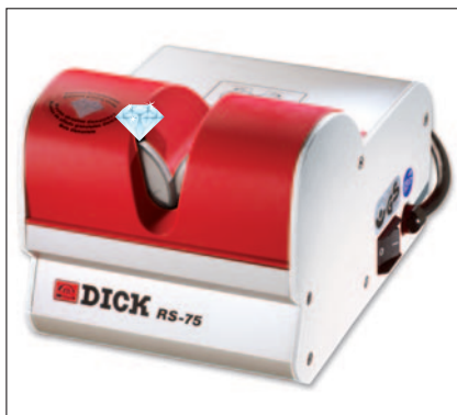
Sharpening Machine DICK RS-75

As leading knife manufacturer Friedr. Dick is certainly competent regarding the sharpening of all types of knives. There are many different requirements for how a knife blade can be ground. F. Dick offers individual solutions e. g. for canteens and supermarkets: